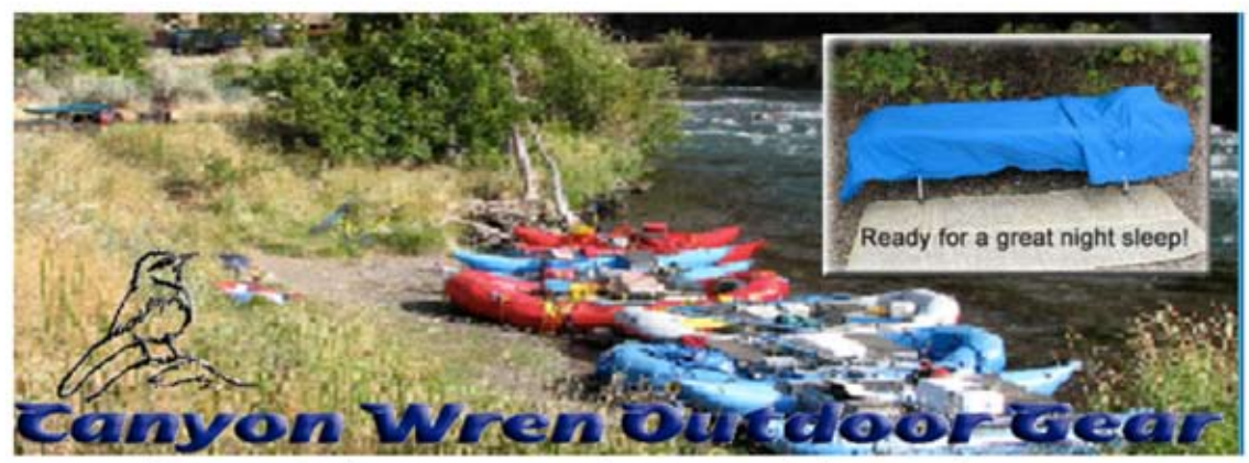
Be ready for your next canyon trip...order your CanyonWren Boater Bivy now!

www.CanyonWrenOutdoorGear.com email: canyonwren1@mac.com