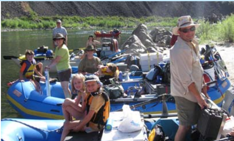
Lone Pine campsite

Sunday we drifted to Lone Pine Bar and had a