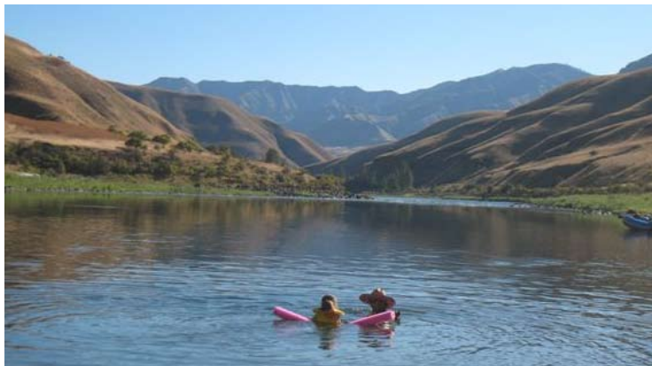
Vic and Miranda swimming at Eagle Creek

the drive home we saw what must have been 50mph winds blowing trees sideways and the air darkened with smoke and dust. Between the cheerful camaraderie, sunny weather, exquisite river cuisine, good flow level, and impeccable timing this was the perfect introduction to the Lower Salmon.